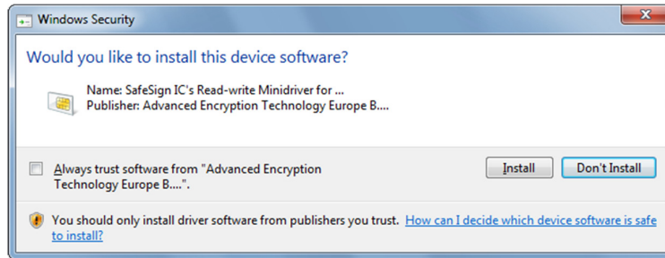
Figure 2: Windows Security: Would you like to install this device software?

During the installation of SafeSign IC Minidriver, Windows Security will ask for permission to install the SafeSign IC Card Minidriver software: